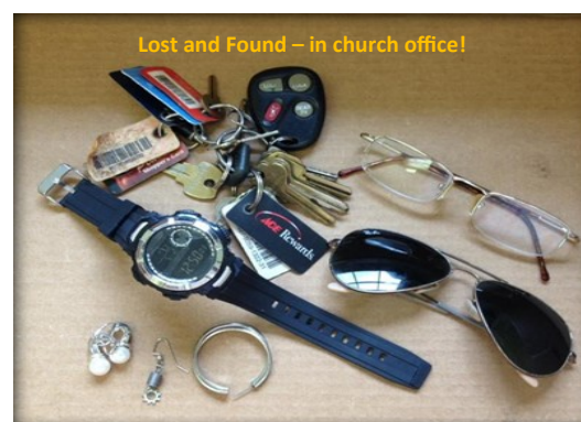
Lost and Found – in church office!